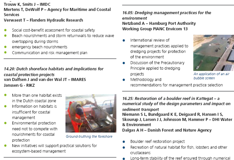
Figure 1. Example for paper digest

The digest will include the paper title, the authors' names and their affiliations, and maximum 5 bullet points to raise interest in your paper and optionally, only 1 picture/image/diagram . Limit each bullet point to less than 15 words. Please provide input for the digest as specified in the text box below.